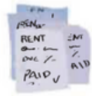
Proof of what you've paid & what you still owe