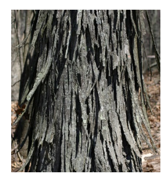
Shagbark hickory bark