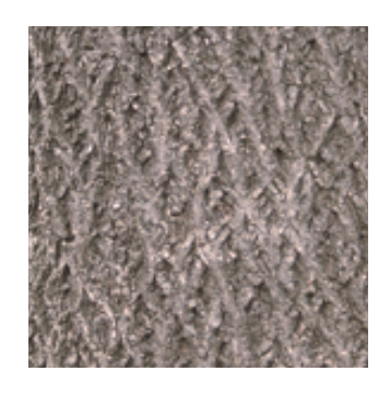
Bitternut hickory bark