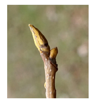
Bitternut hickory bud

As with the oaks, we have three common species of hickory in our area: bitternut, pignut, and shagbark hickory. Bitternut hickory is most easily identified by its buds, which are long, pointed, and bright sulfur yellow in color. The bark of this tree is a little trickier to distinguish, but it is gray and separates into shallow cracks and narrow, crisscrossing ridges. When I was learning to identify this tree, we called the shapes in the bark "crystal latticework." Shagbark hickory is very easy to identify. As its name implies, its bark has a very shaggy appearance, separating into long, rough plates that curve away from the trunk on one or both ends. Pignut hickory can look similar to bitternut or like a mix between bitternut and shagbark, but it does not have the sulfur yellow buds, and its bark may occasionally separate into small loose strips.