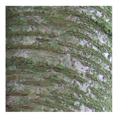
Sweet cherry bark