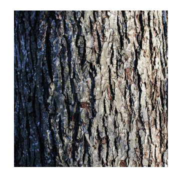
Pignut hickory bark CONTINUED ON PAGE 7