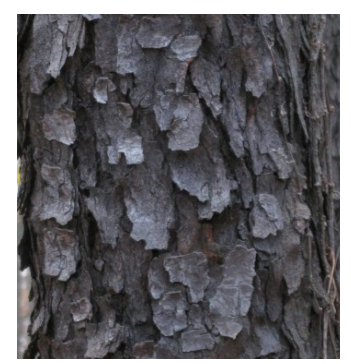
Black cherry bark

There two species of cherry that commonly grow to fullsized trees size in our area. They are black cherry and sweet cherry. Black cherry is a native tree whose bark is dark gray, almost black, and broken into thick irregular plates that curl up on the edges, resembling burnt potato chips. Sweet cherry is not native, and it has dark gray bark that sticks tight to the tree and is covered with conspicuous horizontal lines, called lenticels, which help the tree with gas exchange.