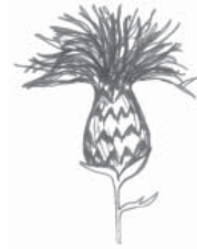
Spotted knapweed flower showing spotted bracts.