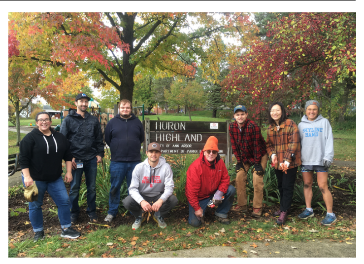
10/21: Coupa and a few individual volunteers worked on the garden beds at Huron Highlands Park . The beds here have been drastically improved this year thanks to several workdays!