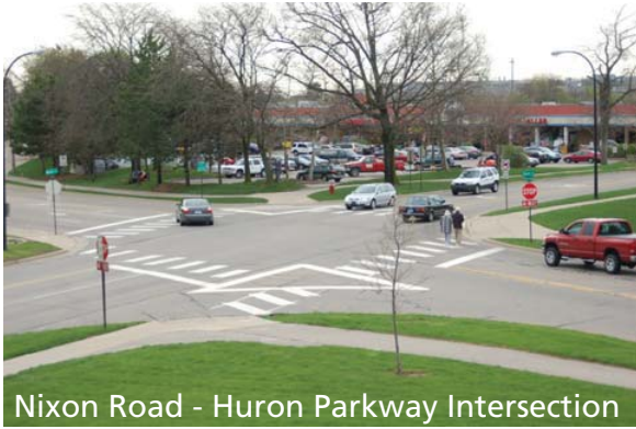
Nixon Road - Huron Parkway Intersection