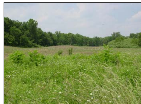
Near Nixon and Dhu Varren Roads

Natural Features Master Plan – Although the City has performed generalized inventories of floodplains, wetlands and woodlands, landforms change over time and such inventories are used only as general guidelines for natural features on a site. The last comprehensive natural systems inventory was conducted for the Northeast Area in the