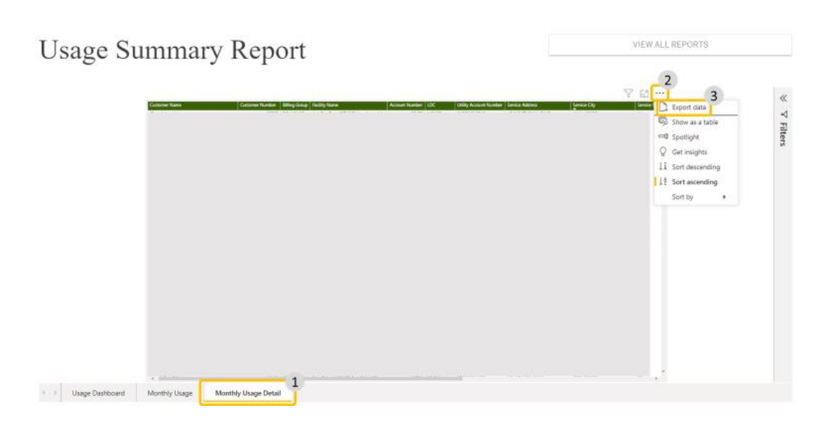
Step 2 Format monthly consumption data

These next steps require the use of Excel or a similar software. If you do not have access to this software, or would like support with these steps, please email <a href="mailto:benchmarking@a2gov.org">benchmarking@a2gov.org</a>