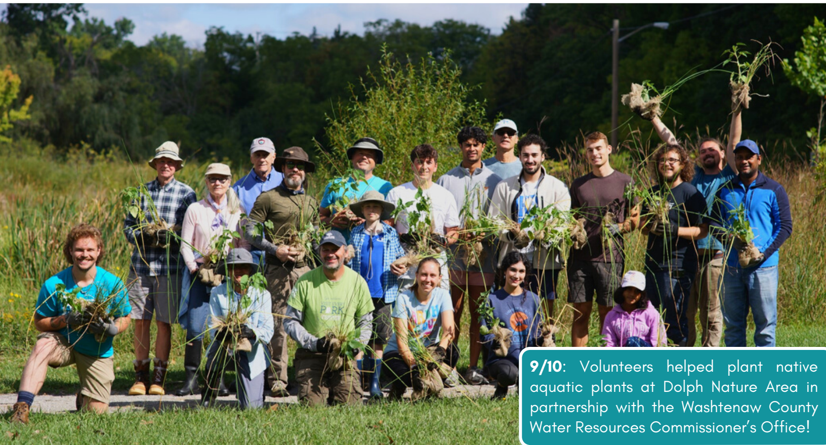
9/10: Volunteers helped plant native aquatic plants at Dolph Nature Area in partnership with the Washtenaw County Water Resources Commissioner's Office!